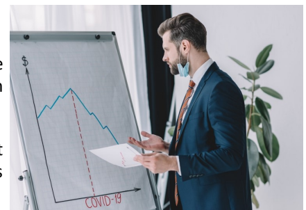
Continues Next Page

Typically, your forecast should project cash flow for the next 12 months but right now, the next 3 to 6 months is essential. Keep updating it at least every month as you get more information and certainty around revenue and costs.